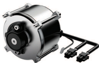
Direct drive brushless motor

A redundant system with a double winding direct drive motor and an additional emergency card make FACE automations suitable for escape routes, in compliance with EN16005.