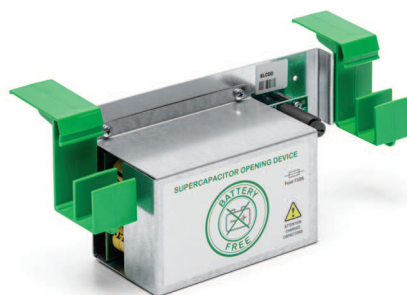
Supercapacitor opening device